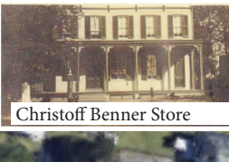
Christoff Benner Store

In the 1960's, this was the location of Circle Motors, Inc. Today-2024 Auto Zone Auto Parts